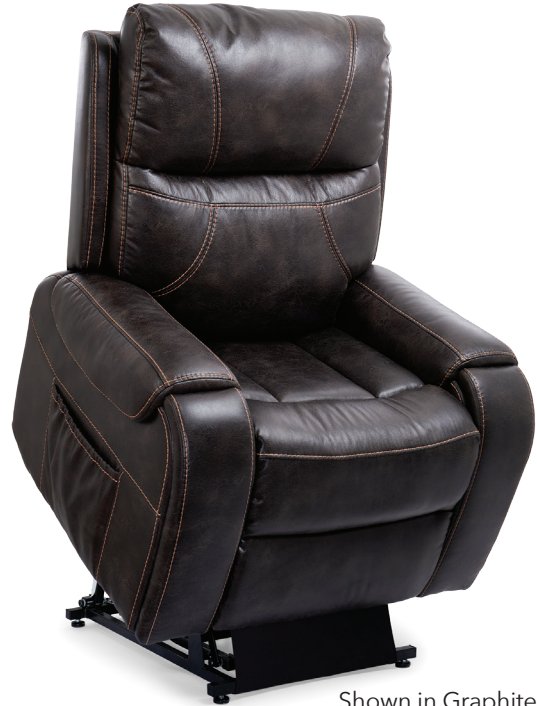
Shown in Graphite

The World's Most Advanced Power Positioning Lift Recliner with Patented Twilight Technology!